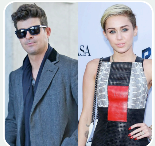
Illustration - (l) Robin Thicke; (r) Miley Cyrus

Self respect means: self worth, self love, self acceptance and self control. Abiding in God will equip you with the strength you need to live according to His will!