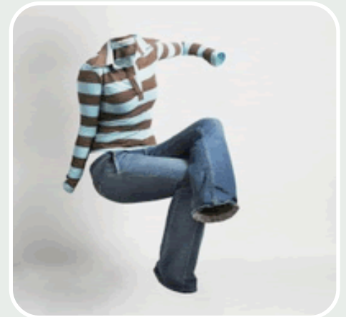
Illustration by: bing.com

Finally, remember your Team: God, family, true friends and yourself - The Fantastic Four! Can you see them or are you hiding out? Do you walk past them without saying hello; don’t notice them at all? You can change your situation by using your power and your team! When you do that, the enemy will disappear!